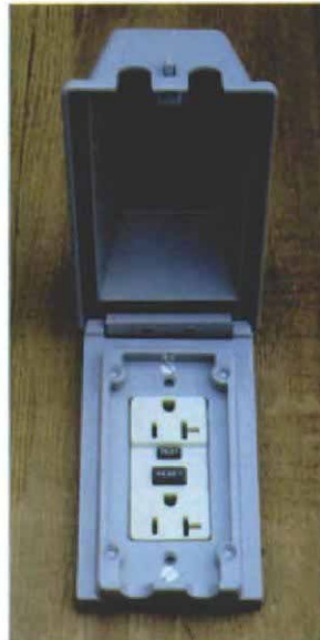
For use outside. A GFCI receptacle used continuously outside should have a box or lid that keeps the connection between extension cord and receptacle dry. The receptacle above is surface-mounted.

Rex Cauldwell is a master electrician and plumber in Copper Hill, Va.