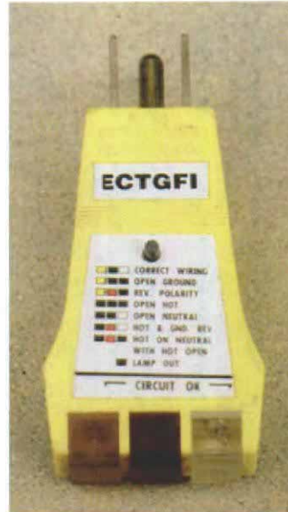
Circuit tester. A simple tester that plugs into a GFCI receptacle creates a current imbalance. If the GFCI receptacle is working properly, the circuit should trip.