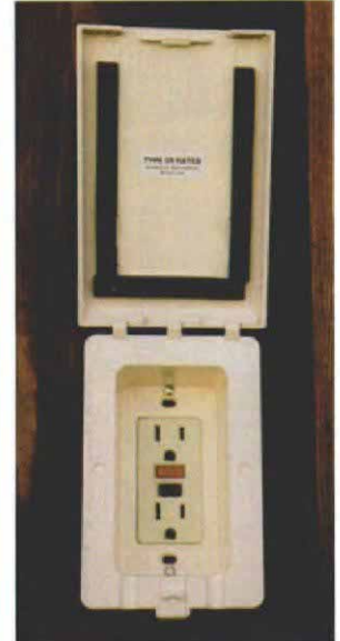
Flush-mount unit. Newer outdoor boxes for GFCI receptacles are not as conspicuous as older units. The receptacle is recessed, and the watertight door is nearly flush to the wall when it is closed.